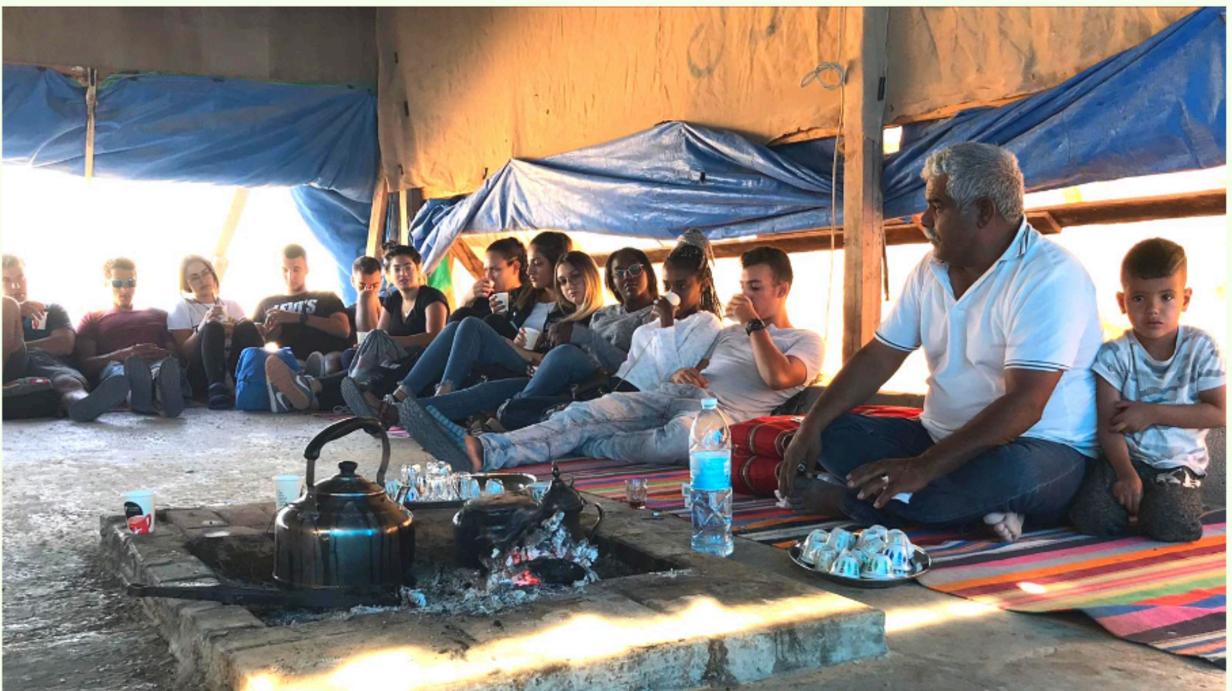
NCF tour with Israeli students

The healthcare system is on the verge of collapse, hospitals are overburdened and there is a shortage of vital supplies. Food and clean water are in short supply. 1.7 million people have been displaced and are living in catastrophic conditions in overcrowded accommodation. Urgent action is needed to prevent further loss of life and address the humanitarian crisis in Gaza. “We urgently call for an immediate ceasefire and unhindered humanitarian access to Gaza, as well as the unconditional release of all hostages by Hamas. We also call on the international community to uphold international humanitarian law to protect civilians and ensure human rights for Israelis and Palestinians”.