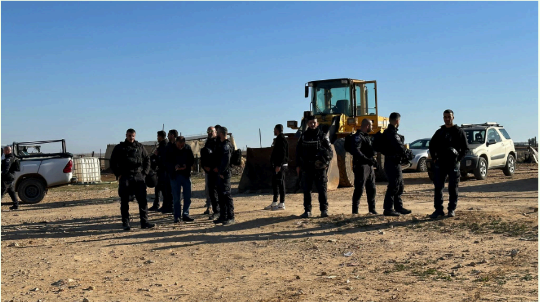
Home Demolition in Bīr Haddāj

We look forward to embarking on this journey with you!